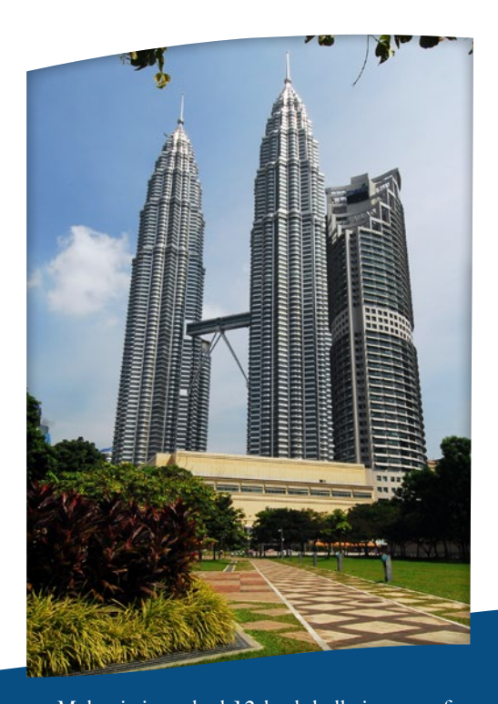
Malaysia is ranked 12th globally in ease of doing business (World Bank Group, 2019)

Business managers are people who are mainly involved in critical activities of managing business from the aspects of finance, people, marketing and strategic planning.